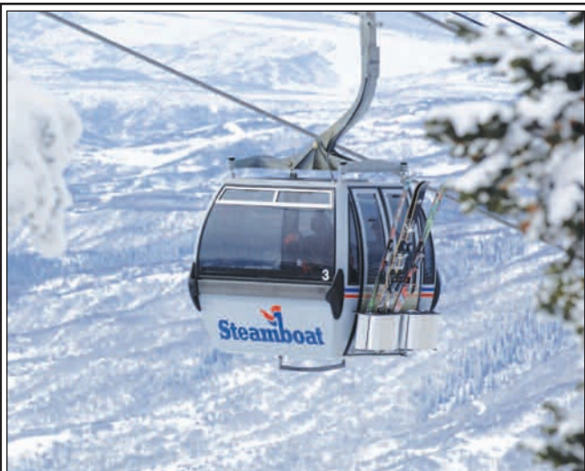
STEAMBOAT SPRINGS, CO – Steamboat's gondola, starting at the center of the bustling base area, brings guests to the Thunderhead Lodge where skiers disperse on many trails to enjoy Steamboat's legendary Champagne Powder. With fine lodging in this authentic Old West town, make it your year to visit Steamboat.

Umbrella Bar & BBQ: The popular Umbrella Bar moved from the base area to Rendezvous Lodge, providing additional indoor/outdoor bar service to guests in the Sunshine Peak area of the mountain. The Umbrella Bar will be open daily from 11 a.m. to 3 p.m. serving drinks and quick bites during the winter season.