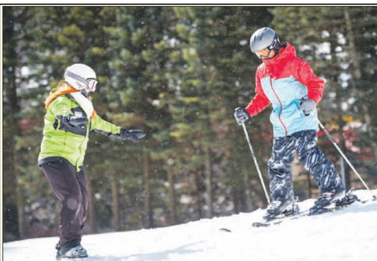
TANNERSVILLE, PA – Camelback Resort is Pennsylvania's No. 1 family friendly mountain with 38 trails; 16 lifts including two high-speed detachable quads and state of the art snowmaking equipment for season-long, great conditions.

Berrelli's serves family Style Italian food in a truly beautiful restaurant and lodge with ski-in/ski-out access. Imagine stopping in to share a giant bowl of pasta with friends and