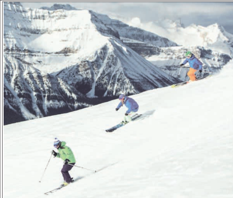
BANFF NATIONAL PARK, AB - With the rugged, glacier formed peaks of the Canadian Rocky Mountains in view, skiers cruise the beautiful trails of Lake Louise, one of the Ski Big 3 resorts easily accessed from Banff.

The Lake Louise Ski Resort is one of the largest ski areas in North America, offering spectacular views, long runs and lots of terrain for all ability levels. With 139 runs, there is a huge variety for beginner, intermediate and expert skiers and riders, making the Lake Louise Ski Resort a great choice for everyone. Big open bowls and gnarly chutes and gullies offer a lot of fun for intermediate and expert skiers as well. It is a five-minute drive from the hamlet of Lake Louise or a 45-minute drive from Banff.