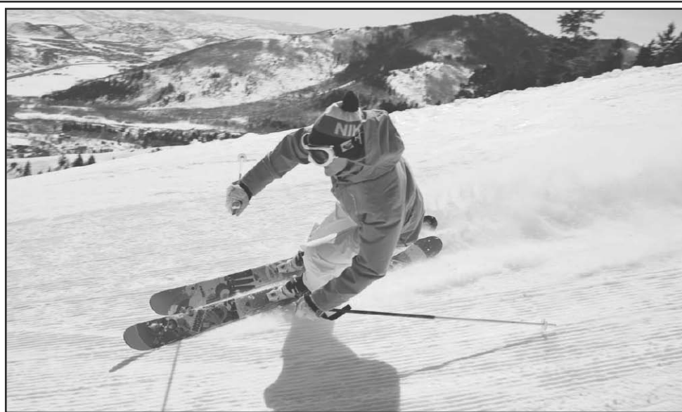
Perfectly groomed conditions are on display at The Canyons Resort in Utah. Located in Park City, just 35 minutes from downtown Salt Lake, The Canyons is one of North America's largest and most accessible resorts.

Deer Valley Resort has expanded its services to include a new property management division that will assure the Deer Valley difference from the moment guests check-in. In addition, the St. Regis Deer Crest Resort will provide a new lodging option for Deer Valley guests. The St. Regis features 181 guest rooms, including 67 suites, luxury amenities, and a ski beach and infinity pool. The Remède Spa will enable guests to refresh with signature treatments after a day on the slopes.