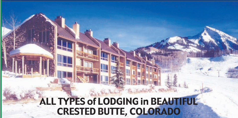
ALL TYPES of LODGING in BEAUTIFUL CRESTED BUTTE, COLORADO

BOOK THIS WINTER'S VACATION EARLY and SAVE BIG! CRESTED BUTTE LODGING 4th NIGHT FREE at ALL PROPERTIES! Not valid 12/26/11-1/1/12 & 3/10/12-3/18/12 1-888-620-SNOW • www.crestedbuttelodging.com