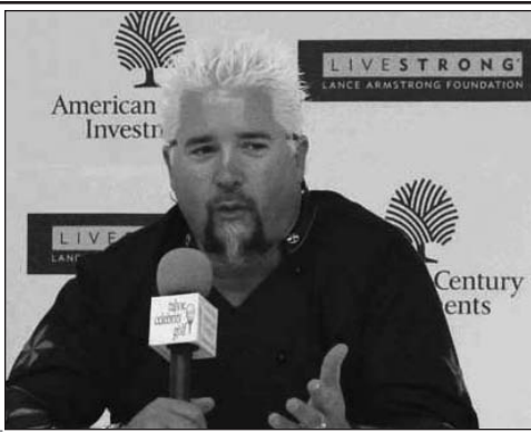
Food Network Chef, Guy Fieri addresses the media in Lake Tahoe last July.

the best moguls. Those were good. I didn't know what the hell they were. I'm seeing all these bumps and everything and I said, "Wow." I was pretty flexible, so I was just zigzagging. I got lessons the first few days when I went out there and the third day I was on the other side, I was on black trails. I was just going along great, then I'd get a little break, and then do all it again.